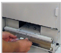
Easy sealing operation