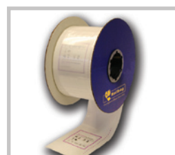
Rollbags™ pre-opened bags-on-a-roll